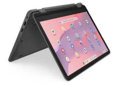
1. Chromebook 500e 4<sup>th</sup> Gen