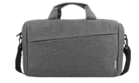
3. Laptop Carrying Case